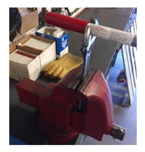
OPTION 1 Crescent Wrench & Vice

- Place crescent wrench into vice and tighten so it is not able to move.